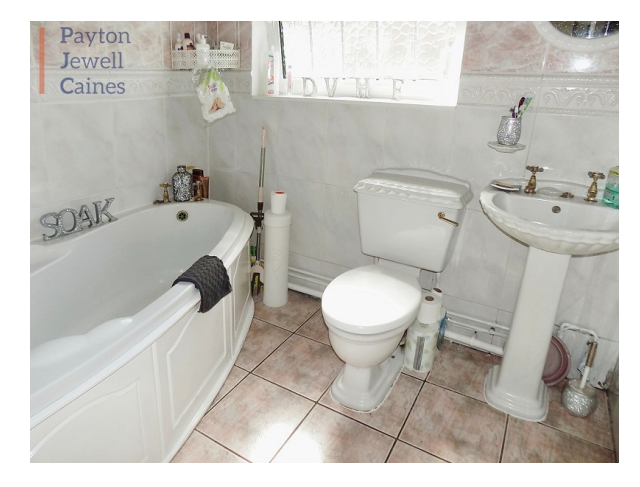
For more photos please see www.pjchomes.co.uk