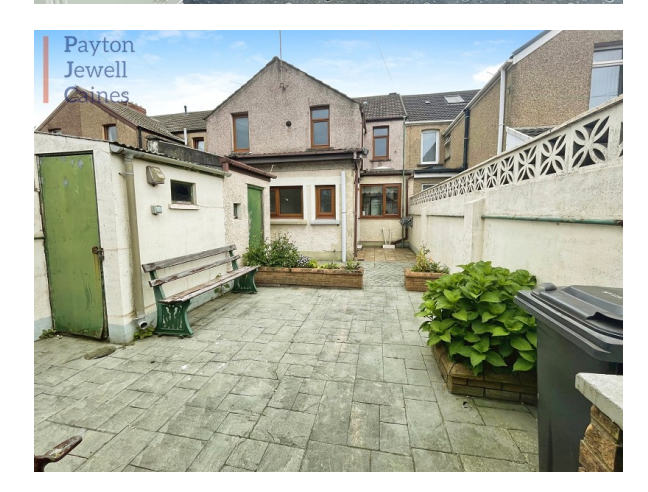
For more photos please see www.pjchomes.co.uk