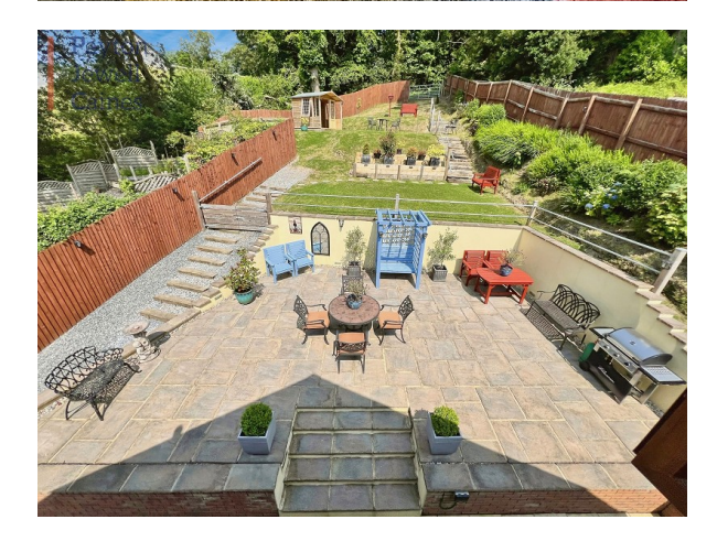
For more photos please see www.pjchomes.co.uk