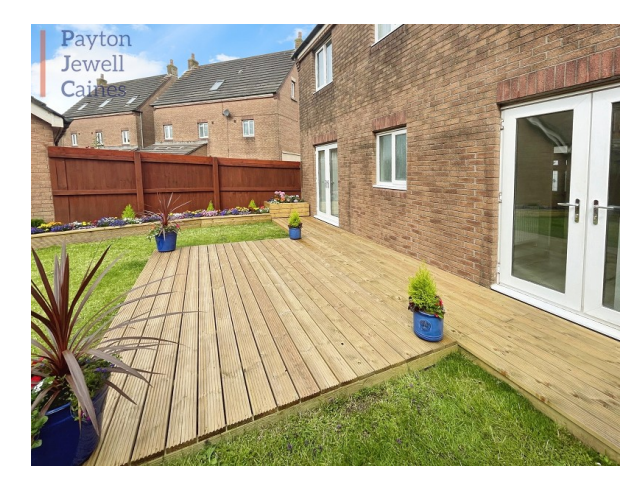
For more photos please see www.pjchomes.co.uk