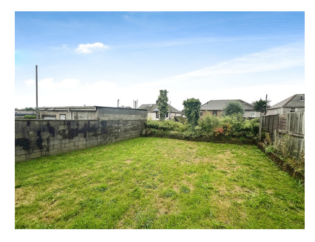
For more photos please see www.pjchomes.co.uk