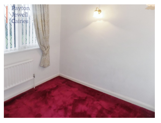
For more photos please see www.pjchomes.co.uk